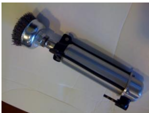
Custom Brushes and Cleaners